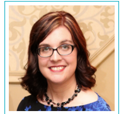
Executive Director Alpha Omega Center